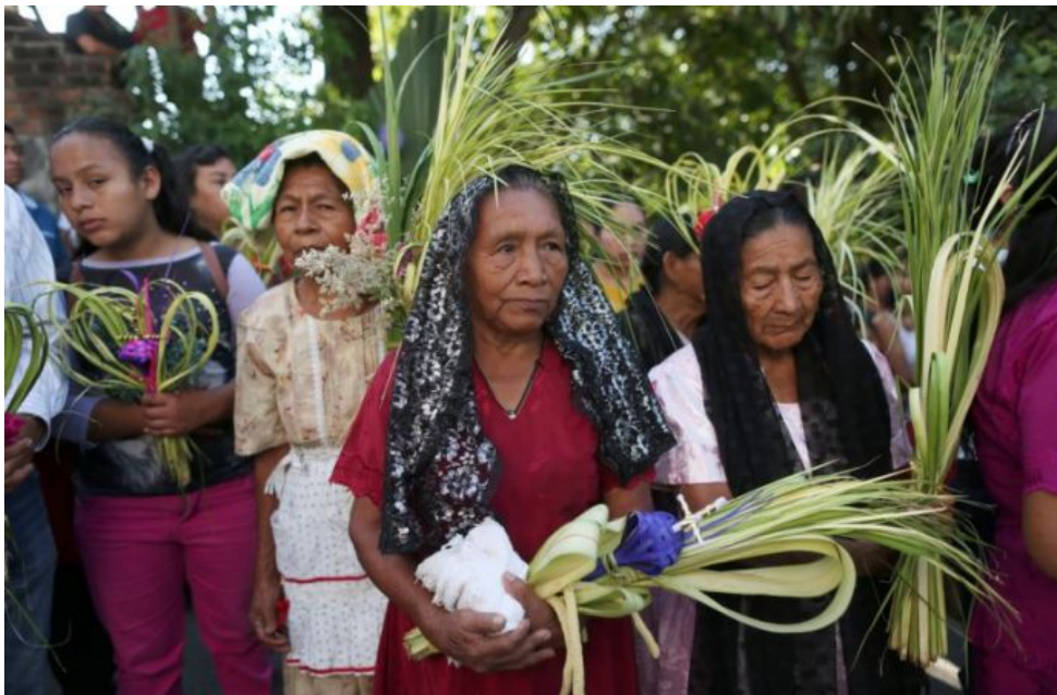
Women take part in the Palm Sunday procession March 25 in El Salvador.