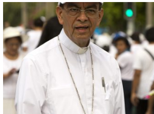
In Washington, Salvadoran diaspora in awe of first Salvadoran cardinal