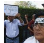
Peru's bishops call for 'honest and independent judicial system'