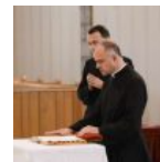
Doctrine remains problem in relations, SSPX affirms after Vatican meeting