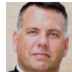
Illinois priest removed from ministry again, years after date-rape drug conviction