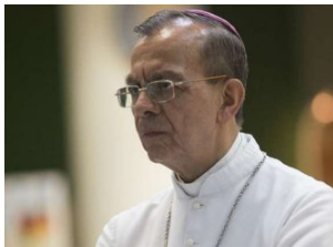
El Salvador’s first cardinal a friend of Blessed Oscar Romero